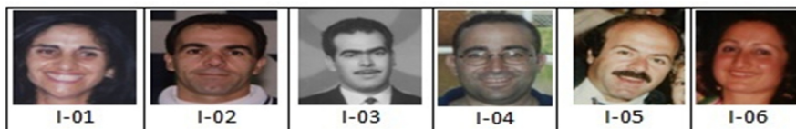
Figure 5. Testing images of happiness expression of age between 30 to 35 years