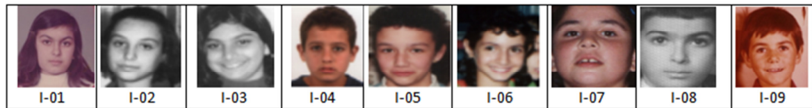
Figure 3. Testing images of happiness expression of age between 10 to 15 years