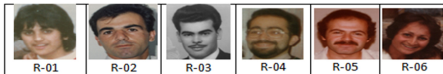
Figure 4. Training images of happiness expression of age between 20 to 25 years