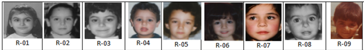
Figure 2. Training images of happiness expression of age between 1 to 5 years